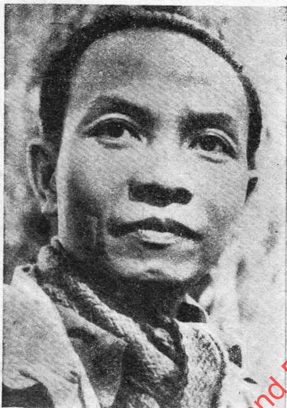
Truong Chinh, General Secretary of the Party

workers and peasants, into the darkest misery. For this reason, the people of Viet-Nam never ceased to struggle for independence and democracy.