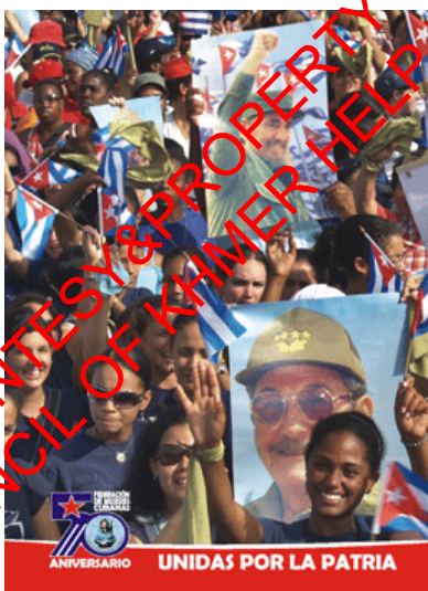
(Figure 5.1 Unidas por la patria)

In honor of the Federation of Cuban Women's fiftieth anniversary ( Federación de las Mujeres Cubanas , referred to as FMC hereafter), women marched to the beat of their patriarchy, literally. 46