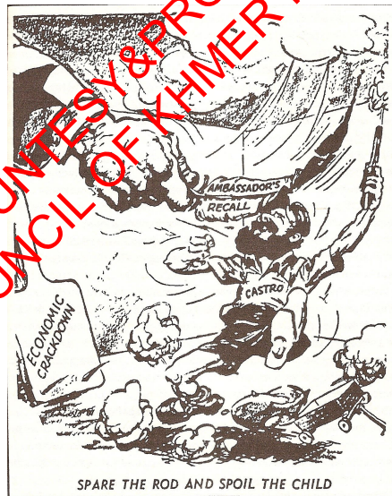
(Figure 6. 1 Spare the Rod and Spoil the Child)

On January 1, 1960 the Charleston News and Courier published an editorial cartoon depicting Fidel as a child in a playpen, with a caption that read, “Spare the Rod and Spoil the Child”. The cartoon suggests the ways in which the American imagination perceived Fidel as an unruly, emotional, and immature child.