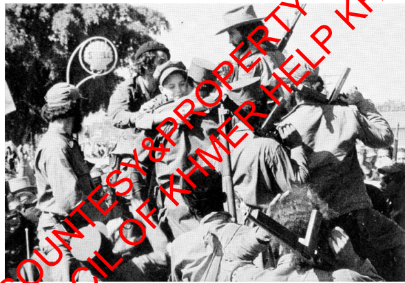
(Figure 4.1 Fidel's "New" Family- Caravan of Victory Havana, January 8, 1959)

A photo from January 1959 captures a young boy surrounded by a group of victorious rebels. Camilo Cienfuegos looks on as both Che Guevara and Fidel embrace the young Fidelito Castro, Fidel's only publicly acknowledged child. 36