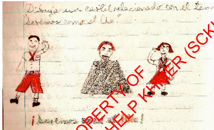
(Figure 3.2 “Seremos como el Che!”)

“symbolic trinity” after Che’s death that was composed of Che, the father, Fidel, the son, and Cuba, the “holy ghost” in “what was a clear pattern of homosocial masculine inheritance or ‘immaculate conception’ that established “the transmission of power along male lines” (138). The Plaza de la Revolución brilliantly symbolizes the homosocial “birth” of the Cuban Revolution as well as the male power structure that sustains it.