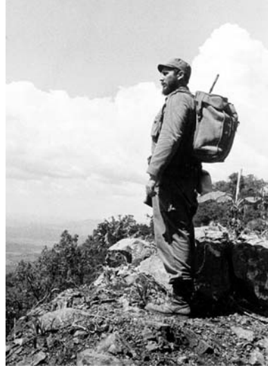
(Figure 7.1 Fidel at Pico Turquino )

To be sure, Fidel has struggled to embody the paradoxical conundrum of a real/old man at least since the time he fainted and fell during a speech in 2004, underwent surgery for intestinal complications in 2006, and—amid rumors and predictions about his imminent death— finally transferred power to his brother Raúl in 2008. This type of paradox, Spector-Mersel says, is central to our understanding of old age and masculinity: “images of old men as an invisible, unmasculine, and paradoxical social category, make it culturally unfeasible to be a ‘true’ man and an old person” (78). In many ways, an aging Fidel has become “invisible” in Cuba, signaled by his withdrawal from the public spotlight. The disappearing of Fidel’s body points to the way in which aging can undermine his authority, a power that now symbolically stands on two frail and weak legs that can no longer climb the Pico Turquino . His physical withdrawal, however, has coincided with a replacement by younger versions of himself, which have cropped up across the city landscape and in the media. On my first research trip to Cuba in 2008, for example, I found the newly produced poster “Cuba Postcastro” whose portrayal of Fidel in the Sierra Maestra represents a symbolic journey into a heroic past that was defined by exemplary masculinity. Thus the act of remembering