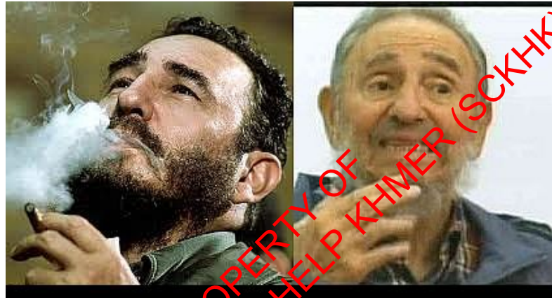
(Figure 7.3 Young Fidel and old Fidel: A comparison)

making nightly television appearances in his customary olive green fatigues. While some celebrated his return, others, including the internationally famous blogger Yoani Sánchez, bemoaned his resurrection in her blog entry from August 18, 2010. Yoani placed two photos of Fidel—one young and one old— side by side (see to the right), which perfectly articulates the theme of the entry.