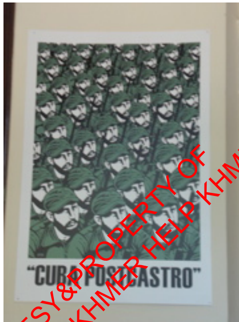
(Figure 7.2 Cuba Postcastro)

Fidel—as this poster suggests— is tied to a bodily remembrance, which quite literally serves to remember an aging body by replacing it with a young one. At the same time, this poster postulates that the young and masculine Fidel lives on and is reproduced in the new generations of Cuba’s men, forever young.