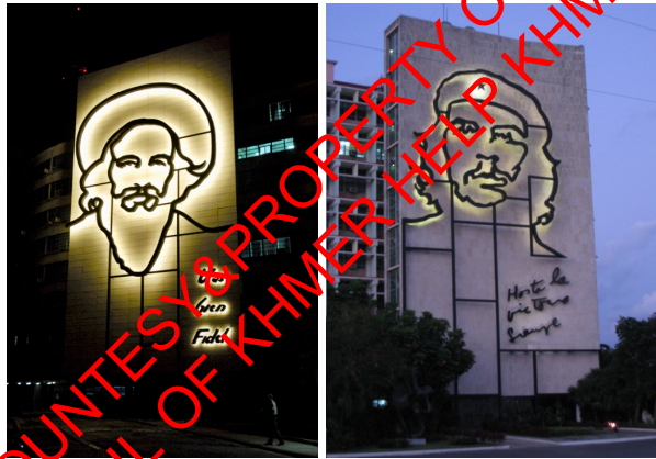
(Figure 3-1 Camilo and Che in the Plaza de la Revolución)

In the Plaza de la Revolución oversized images of Che Guevara and Camilo Cienfuegos, Fidel’s closest compañeros, are perfectly positioned to gaze at the site where the comandante delivered numerous speeches at the base of the José Martí monument. Both their faces, coupled with Camilo’s famous phrase “vas bien Fidel” seem to suggest that these now deceased rebels still support their leader even as they rest in their graves. 21