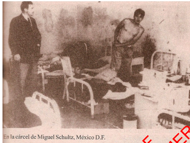
(Figure 3.3 Fidel and Che in Mexico)

respuesta tajante de Fidel: ‘Yo no te abandono’” (6). The picture below, which is reproduced in a volume titled El Che en Fidel Castro , serves as a visual representation of Che’s text.