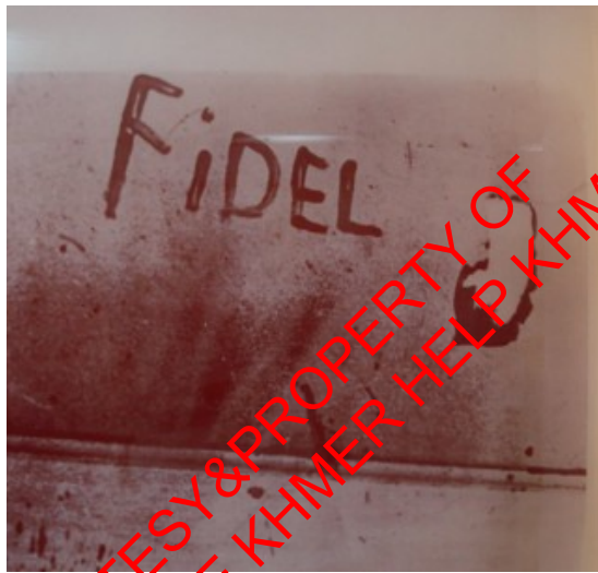
(Figure 2.1 “Fidel” Written in Blood)

As Cuba entered into the Revolution, it brought with it a new set of heroes. For example, on April 15, 1961 a young man, Eduardo García Delgado, wrote Fidel's name with his own blood on the wall of a building shortly before dying.