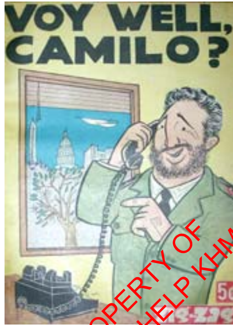
(Figure 6.2 Voy well, Camilo?)

also try to make sense of Fidel; they comment on his rugged appearance and lack of “class”, pointing out that it sharply contrasts with Batista.