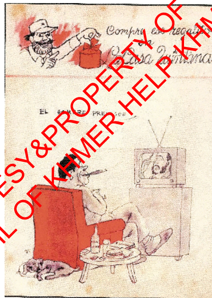
(Figure 6.3 El hombre previsor)

advertisement he is smoking an H. Upmann cigar that is touted as “orgullo nuestro”. The advertisement implies that just as the cigar is Cuba’s pride, so too is the man smoking it. Fidel was becoming a household name with a stamp of Cuban authenticity, legitimizing his claim to take back Cuban manhood, which had been emasculated by North Americans. Famous Cuban cartoonist Conrado Massaguer brilliantly demonstrates how Fidel further challenged North American hegemony with his cartoon from 1959 that depicts the leader in the television set with a caption that reads: “Compre ese regalito en La Casa Quintana”. 63 The name of the product is “el hombre previsor”.