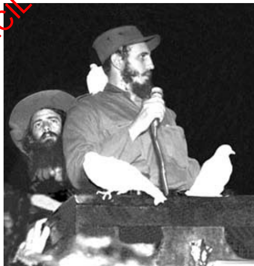
(Figure 2.3 Fidel and the Doves- Havana January 8, 1959)

eight days so as to witness the hero's entry, which will confirm his own heroism, symbolically releasing him of his anxiety to prove his manhood. Thus, to see Fidel becomes Alfredo's new obsession. In fact, as soon as he regains consciousness, one of the first words on his lips is Fidel, and he continues to pepper his mother with questions: "mami...¿Fidel llega pronto", "mami...¿qué dicen de Fidel?" (440-443). Finally, a television is brought to the hospital room so Alfredo can witness his idol's triumphant arrival in Havana. When he finally catches his first glimpse of Fidel, he says: "Mami, es él, ¿verdad? Está estupendo" (443). As he listens to Fidel's animated speech, Alfredo begins to fade, which does not surprise the doctor. For he is astonished that Alfredo has clung to life this long: "es increíble que haya resistido hasta aquí. Sólo una fuerza superior lo ha ido empujando" (445). Without a doubt, that force is Fidel who has the power to redeem an entire nation, which is visually reaffirmed in the photograph to the right that was taken during Fidel's first speech just after his arrival in Havana. This iconic image of Fidel captures white doves descending from the heavens, divinely appointing him Cuba's new leader. 19