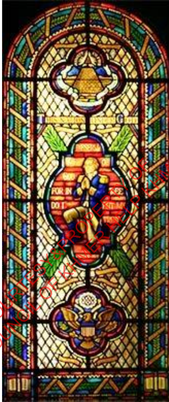
Stained glass window of Washington kneeling in prayer, Capitol Prayer Room, U.S. Capitol, Washington, D.C.