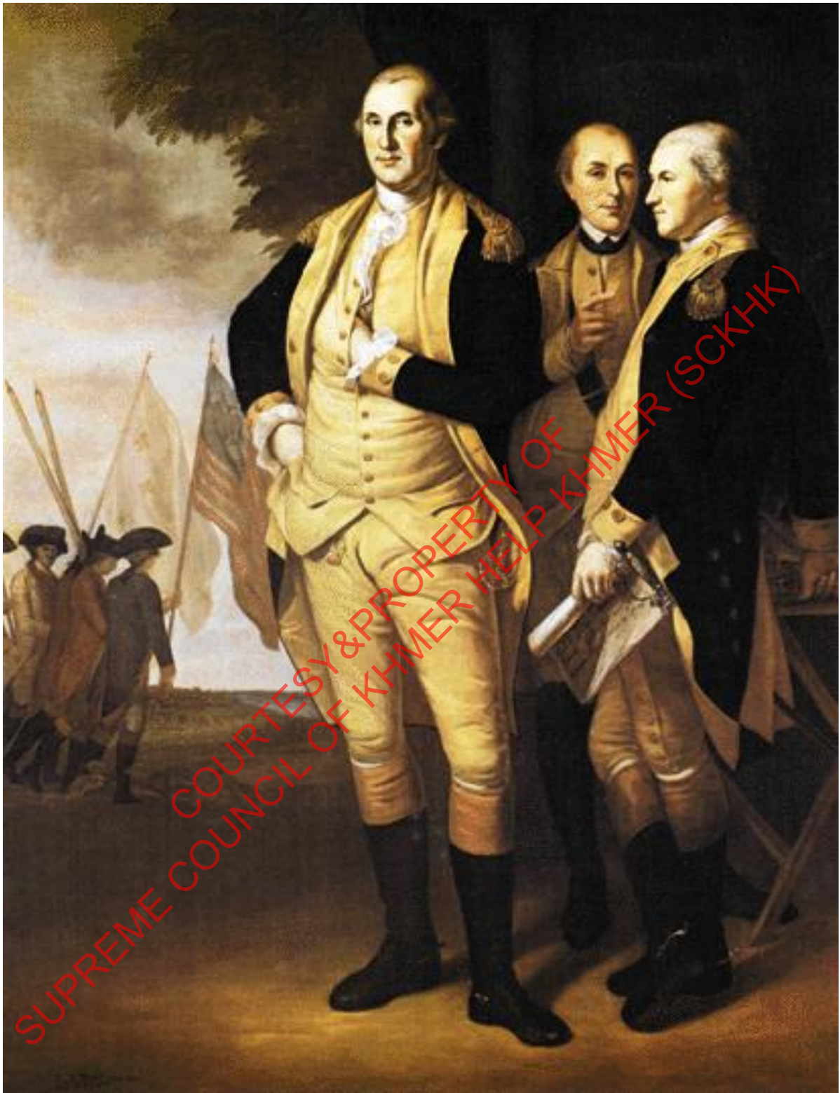
"Washington, Lafayette, and Tilghman at Yorktown" by Charles Willson Peale