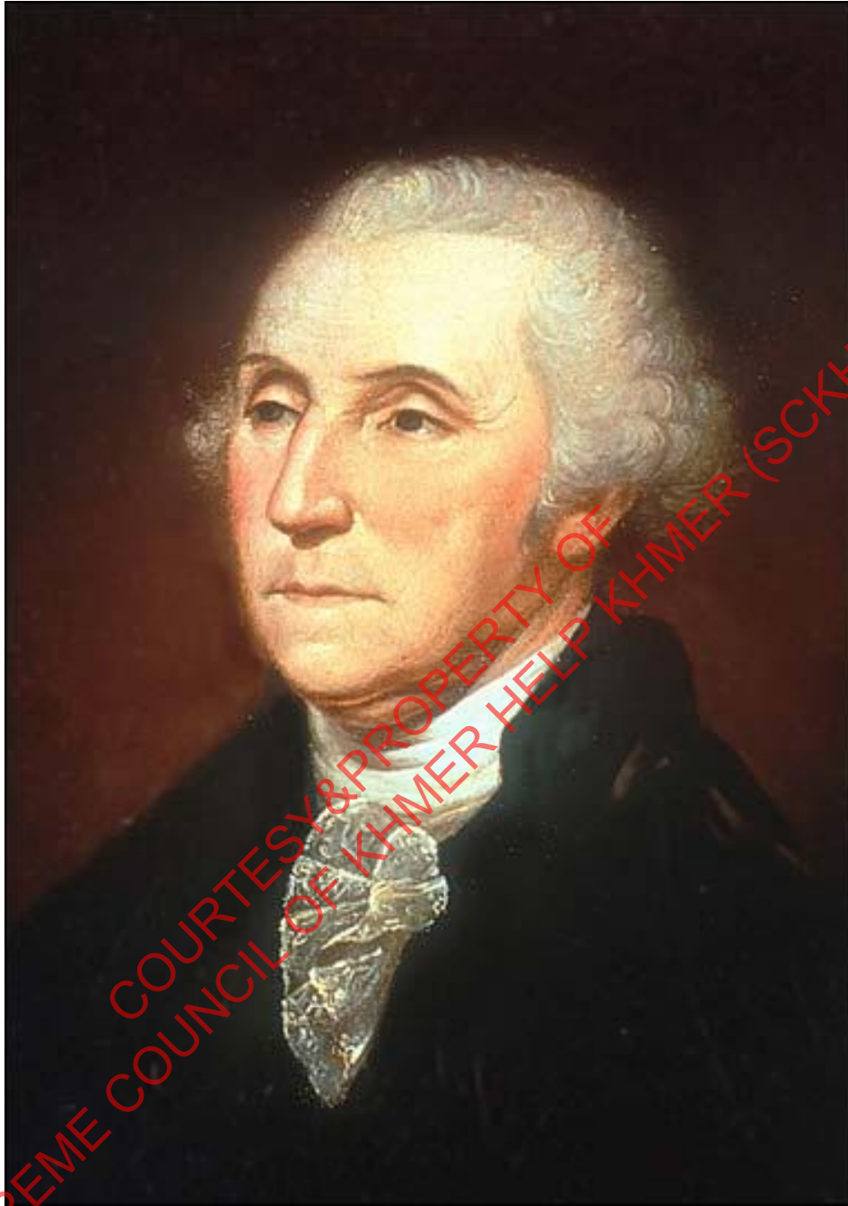
Portrait of George Washington, painted by Charles Willson Peale, 1795-1800